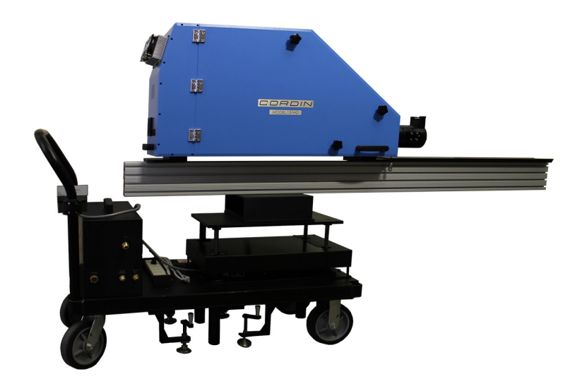
Model 1500 Stand shown with 131-HD Streak Camera and Rail-mount option

An optional integrated rail mount system enables secure and precise placement of the photo subject.