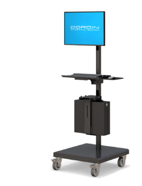
Separate PC Control Station (included)